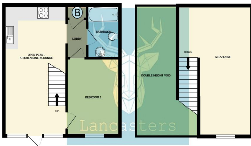
1ST FLOOR 237 sq.ft. (22.1 sq.m.) approx.

TOTAL FLOOR AREA: 641 sq.ft. (59.6 sq.m.) approx. Whilst every attempt has been made to ensure the accuracy of the floorplan contained here, measurements of doors, windows, rooms and any other items are approximate and no responsibility is taken for any error, omission or mis-statement. This plan is for illustrative purposes only and should be used as such by any prospective purchaser. The services, systems and appliances shown have not been tested and no guarantee as to their operability or efficiency can be given. Made with Metropix ©2023